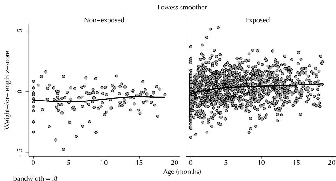
Figure 3. Observed weight-for-length z-scores by exposure to prophylactic treatment to prevent the vertical transmission of HIV. Belo Horizonte, Southeastern Brazil, 1995-2003.

The variables clinical group ( p < 0.0005 ), age ( p < 0.0005 ) and exposure to antiretroviral therapy for PMTCT ( p = 0.003 ) were significantly associated with the weight-for-age z-score in the univariate mixed-effects linear regression analysis. The final model (Table) shows a decrease in the weight-for-age z-score among the infected infants over time. The non-infected infants presented monthly average increases of 0.08 SD in their weight-for-age z-score. At six months, the