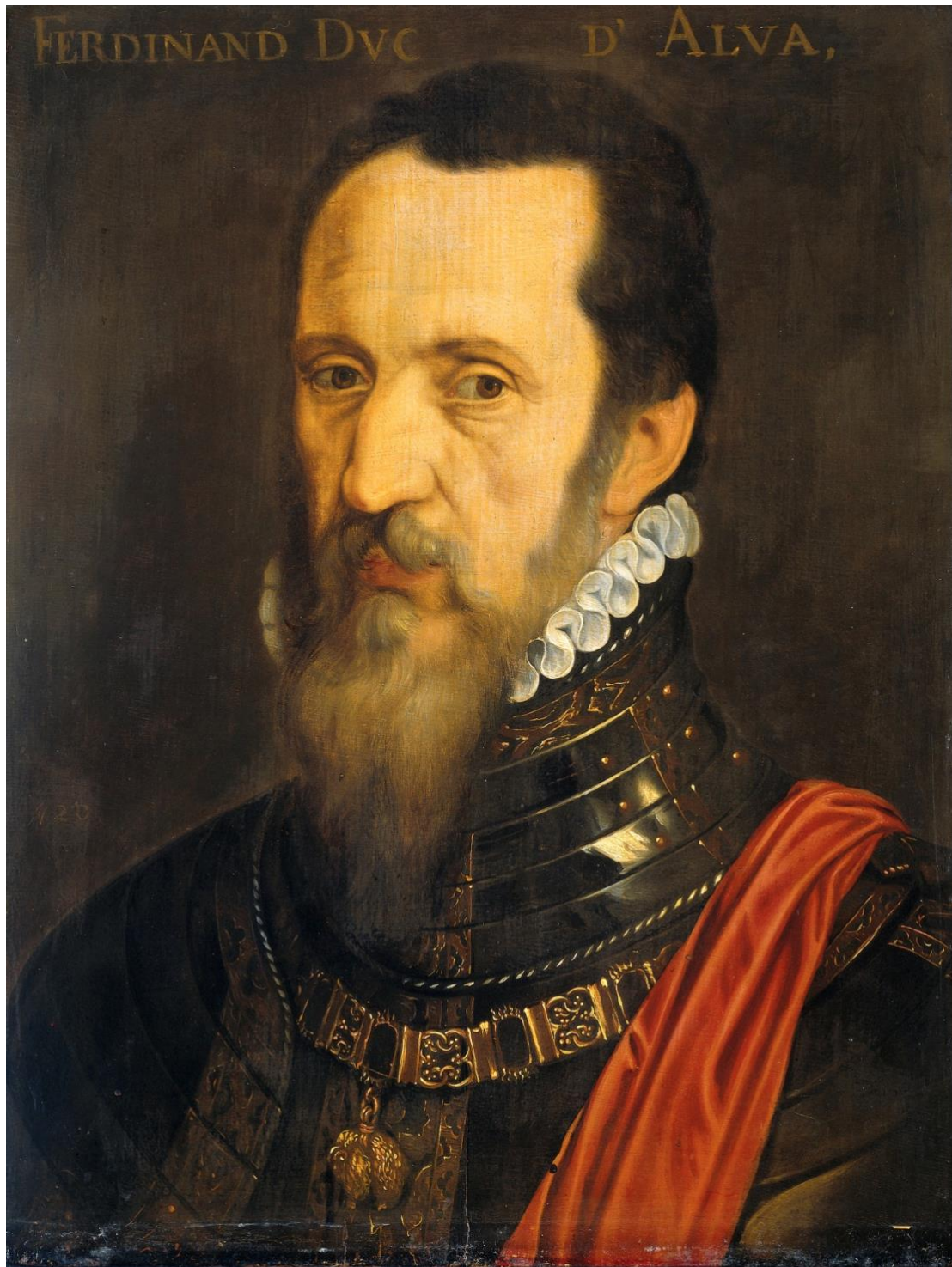
Willem Key (copy), Portrait of Fernando Álvarez de Toledo, duke of Alba, c. 1620. Oil on panel. Rijksmuseum Amsterdam, inv. no. SK-A-18.