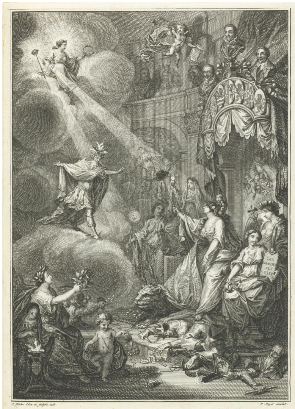
Simon Fokke, Centennial of the 1648 Peace treaty of Münster, 1748. Etching and engraving, Rijksmuseum Amsterdam, inv. no. RP-P-OB-84.046.