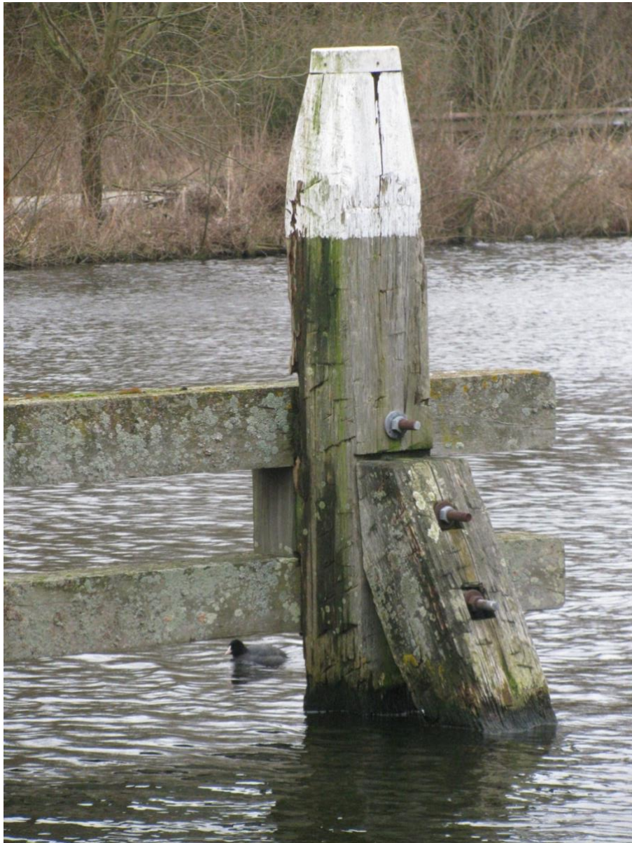
‘Dukdalf’, photograph by the author, Amsterdam 2013.