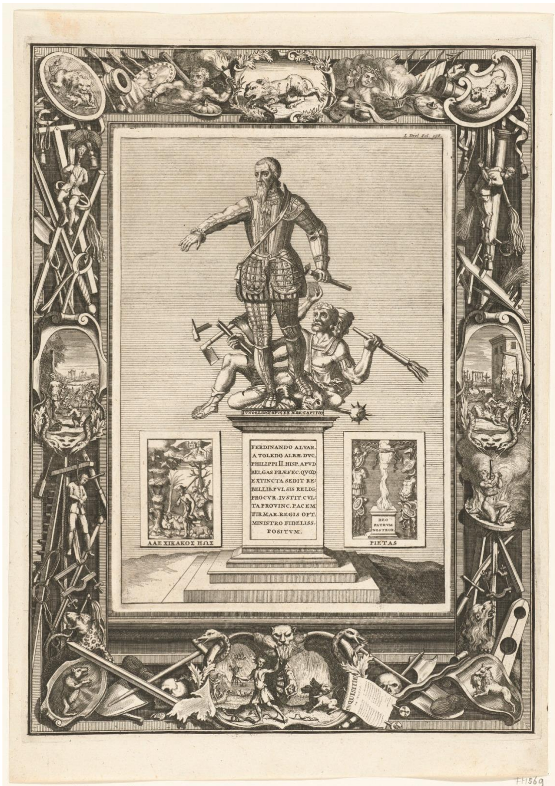
Anonymous copy after Philips Galle's engraving of Jacques Jonghelinck's sculpture, Monument to the duke of Alva of 1571, 1725. Etching, Rijksmuseum Amsterdam, inv. no. RP-P-OB-79.154.