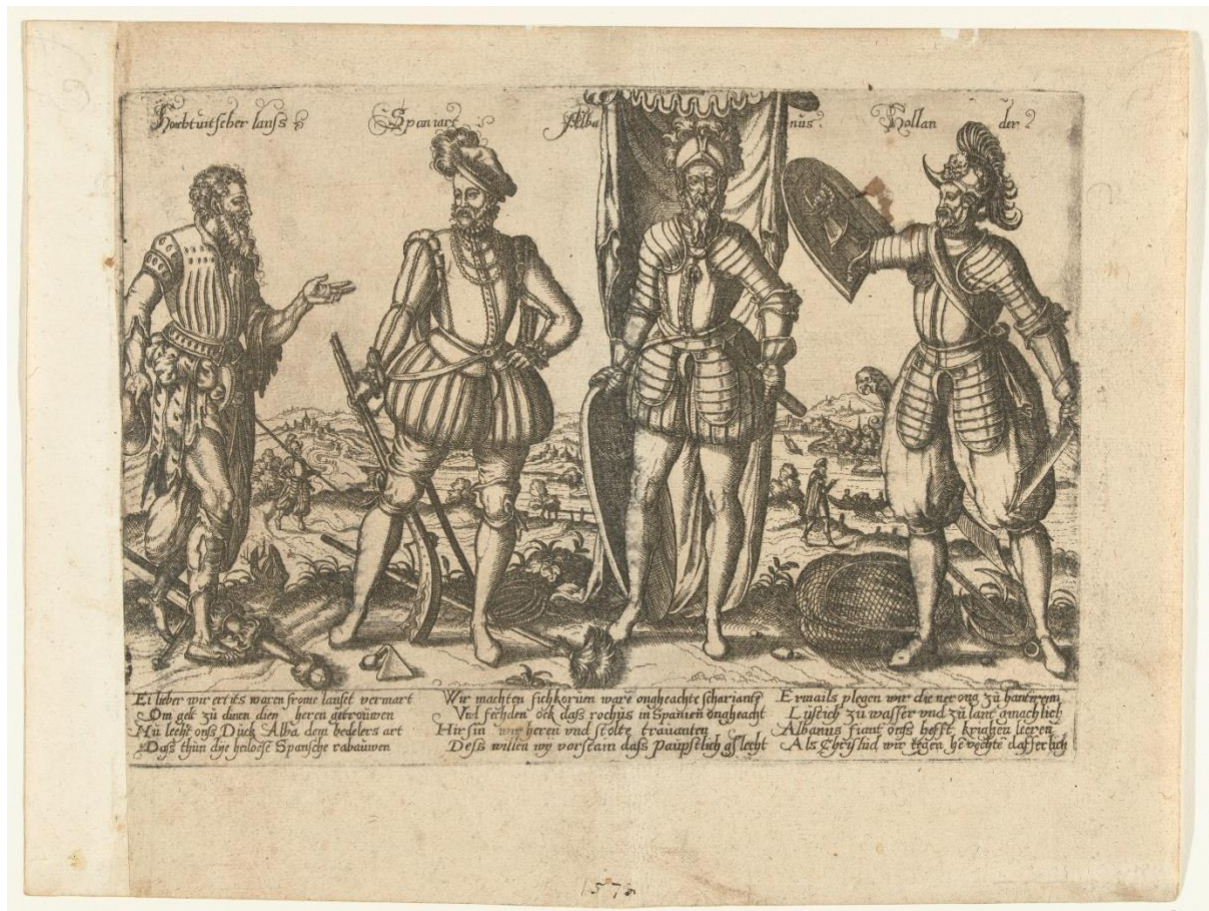
Anonymous (Germany), The complaint of the German and the Dutchman, 1567. Etching, Rijksmuseum Amsterdam, inv. no. RP-P-OB-79.022.