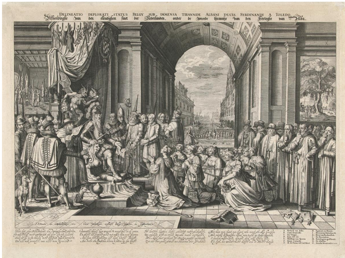
Willem Delff, published by Jan Pietersz. van de Venne in Middelburg, The throne of Alva, 1622. Engraving, Rijksmuseum Amsterdam, inv. no. RP-P-OB-79.001.