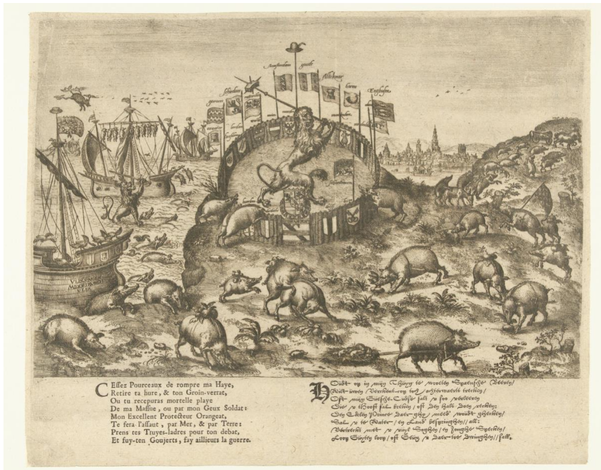
Anonymous (Netherlands), Stop rooting in my garden Spanish pigs!, c. 1580. Etching and letterpress, Rijksmuseum Amsterdam, inv. no. RP-P-OB-77.682.