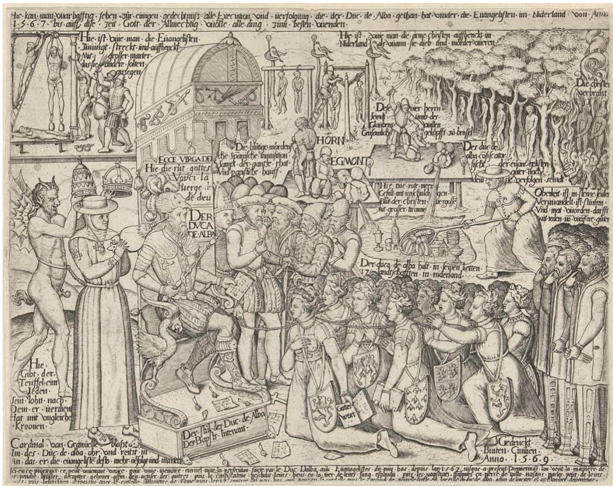
Anonymous (Germany or the Netherlands), The throne of Alva, 1569. Engraving, Rijksmuseum Amsterdam, inv. no. RP-P-OB-79.002.