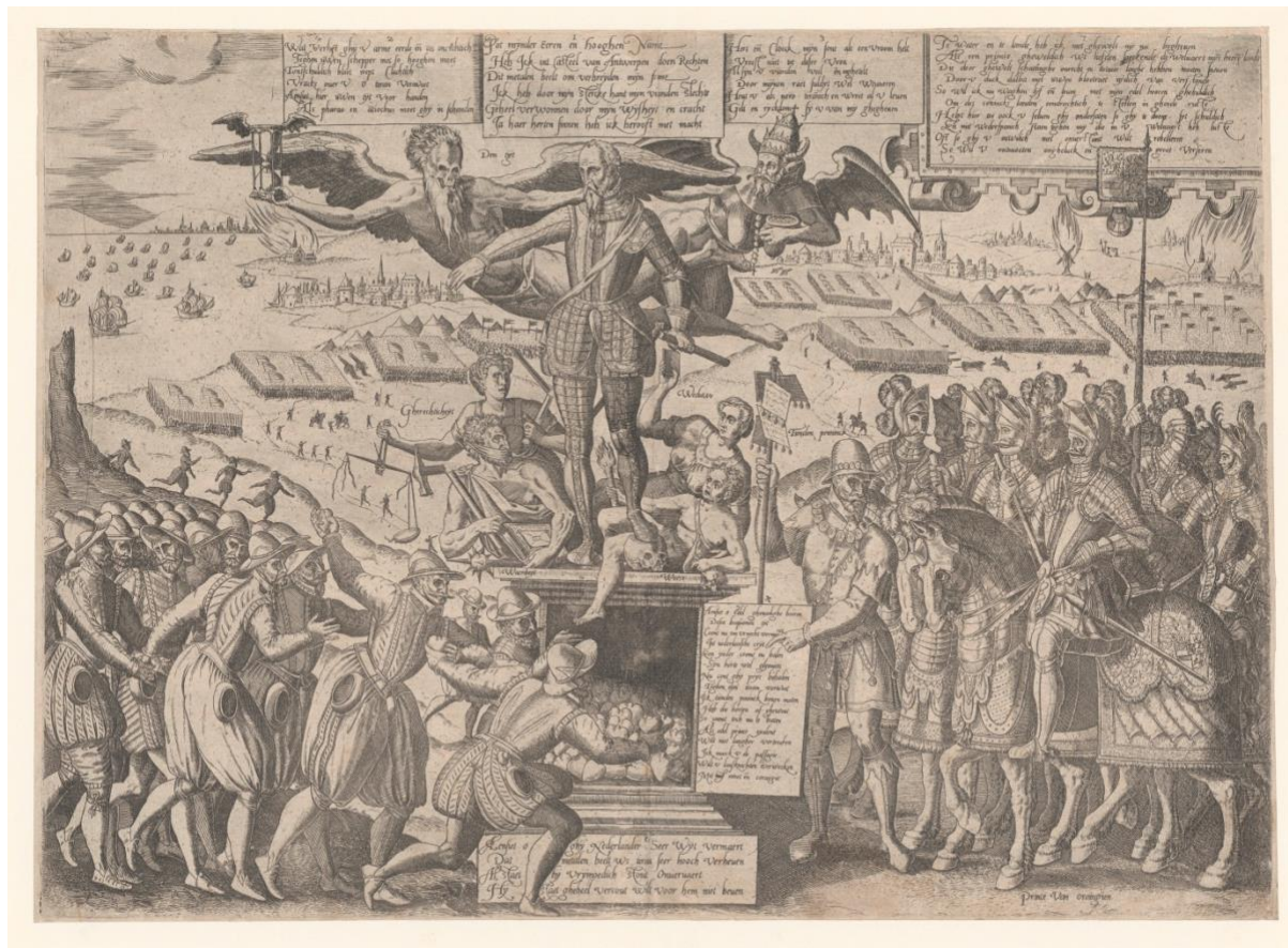
Anonymous (Netherlands), Satire on the duke of Alva's statue, c. 1572. Etching, Rijksmuseum Amsterdam, inv. no. RP-P-OB-79.166.