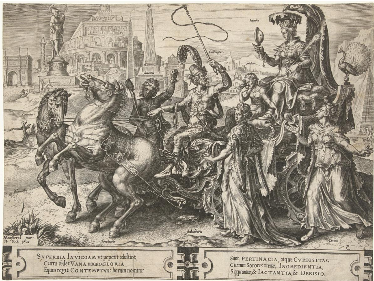
Cornelis Cort after Maarten van Heemskerck, published by Hieronymus Cock in Antwerp, The Triumph of Pride (Nr. 3 in the series: The cycle of vicissitudes of human affairs), 1564. Engraving, Rijksmuseum Amsterdam, inv. no. RP-P-1911-434.