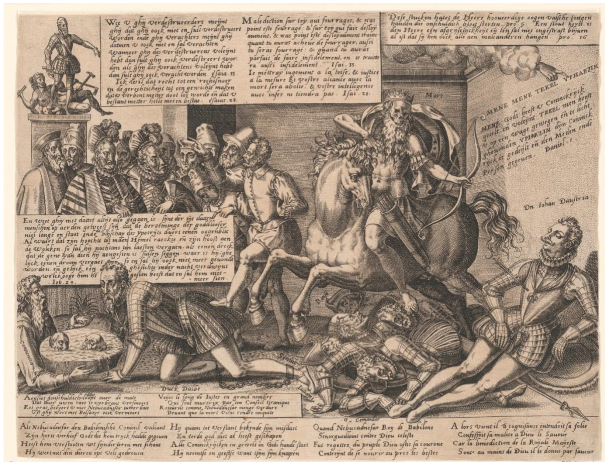
Anonymous (Netherlands), The death of Don John of Austria and the humiliation of Alva, 1578. Engraving, Rijksmuseum Amsterdam, inv. no. RP-P-OB-79.397.