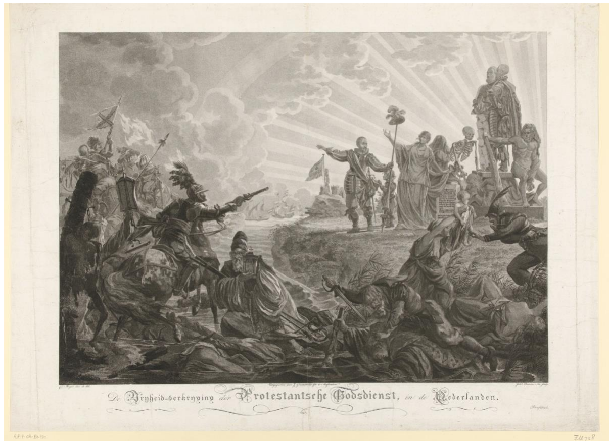
Joannes Bemme after C. Meyer, Celebration of the freedom of Protestant religion in the Netherlands, c. 1827. Stipple etching, Rijksmuseum Amsterdam, inv. no. RP-P-OB-80.441.