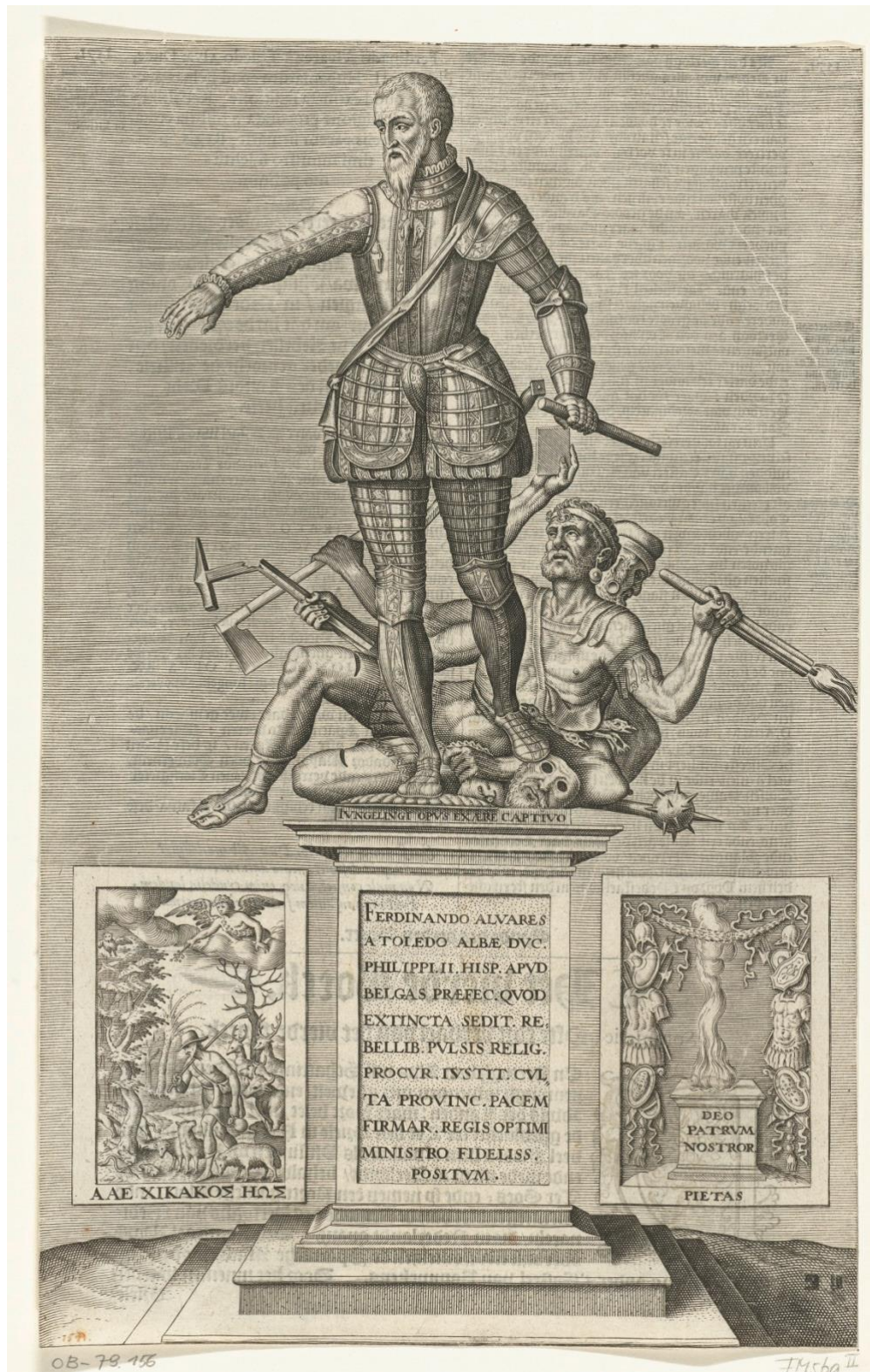
Anonymous copy after Philips Galle's engraving of Jacques Jonghelinck's sculpture, Monument to the duke of Alva of 1571, c. 1650. Engraving, Rijksmuseum Amsterdam, inv. no. RP-P-OB-79.156.