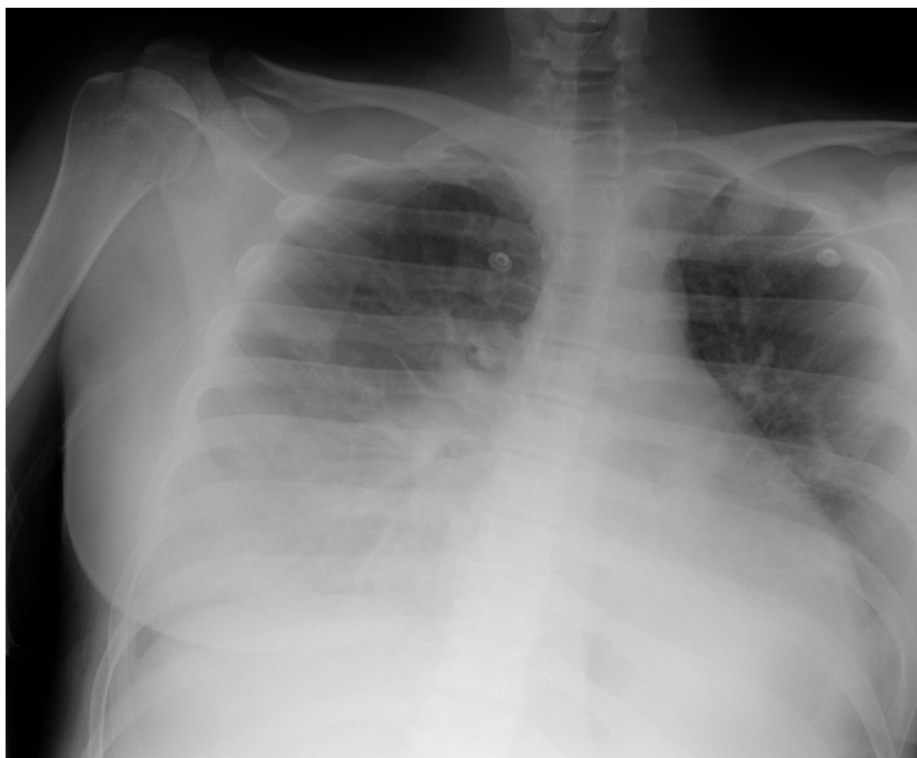
Figure 2. Chest X-ray of the patient showing bilateral lower lobe consolidation with pleural effusion.

The infant was discharged after a twelve days course of intravenous antibiotics, and follow-up examinations over a three-year period revealed a healthy and neurologically intact child.