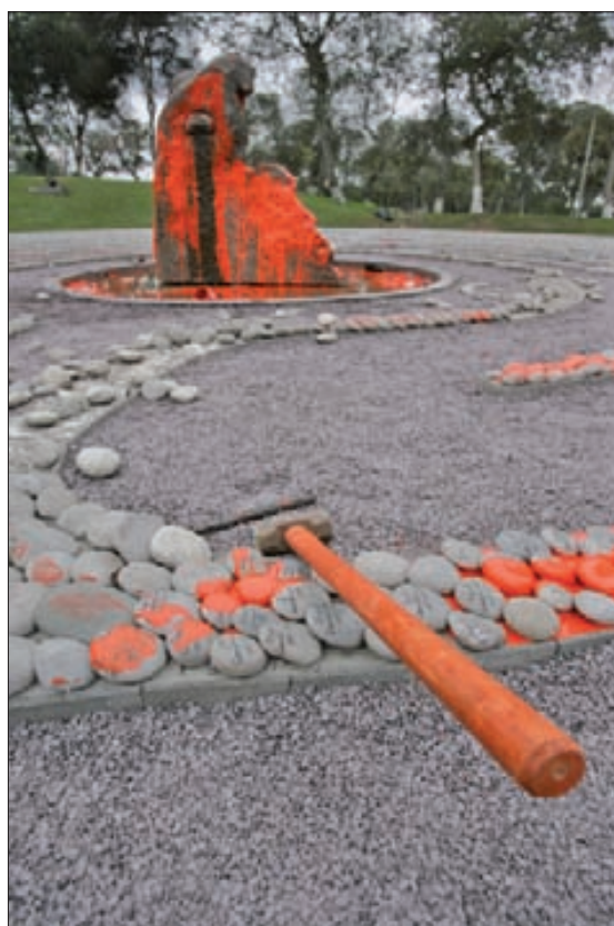
Figure 7. El ojo que llora after vandalism.