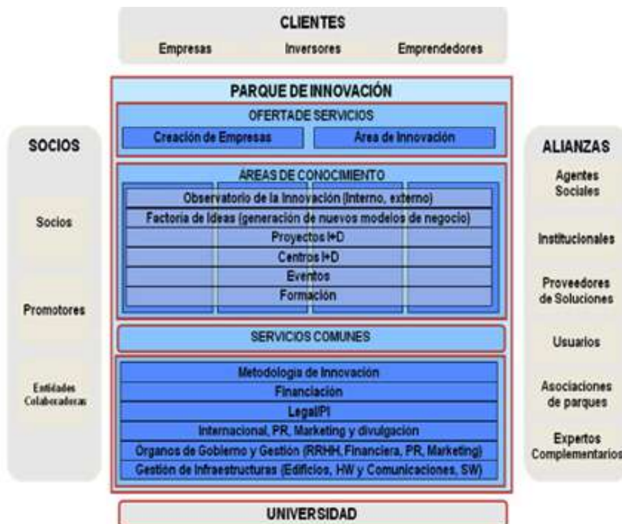
Figure 1: General Model of a Services for People Innovation Park. Source: SIPISP (2008).

The problematique of Science and Technology Parks and Innovation Parks is characterized by Gonzales (1997) as complex, with intrinsic elements of uncertainty and an elevated potential for conflict between actors. This author considers that the central aspects of this problematique are constituted by the set of heterogeneous and numerous actors, each with their own activities and objectives; the interface role of the university with the productive sector, which is controversial and complex; the effort required by technological development; the need to develop the technological capabilities of sources adequate for the undertaking; the attraction of enterprises and their growth process; the need to set up appropriate financial and physical infrastructure.