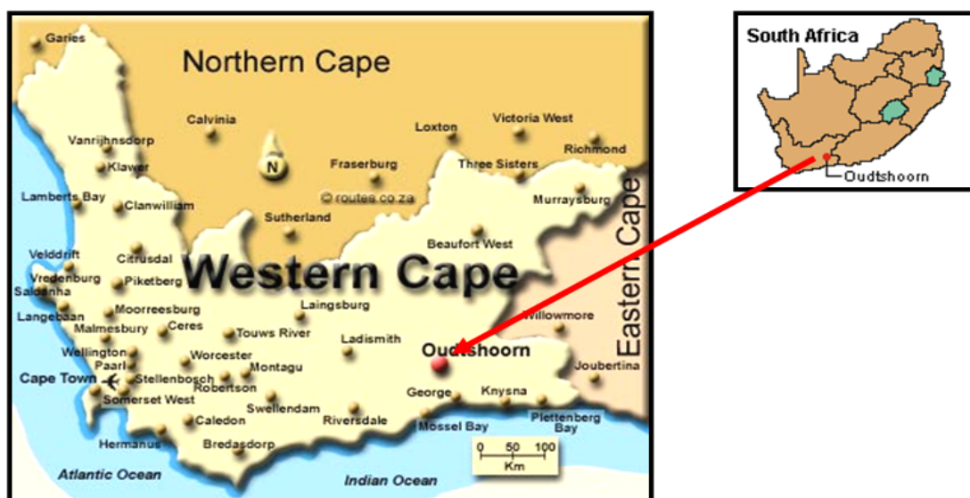
Map 1: Western Cape Province, Oudtshoorn

In order to maximise the growth and provide quality services to entrepreneurs at the KKNK, festival organisers should have a greater understanding of the role and attributes of entrepreneurs. The purpose of this article is to explore the attributes and role of entrepreneurs at the KKNK Festival.