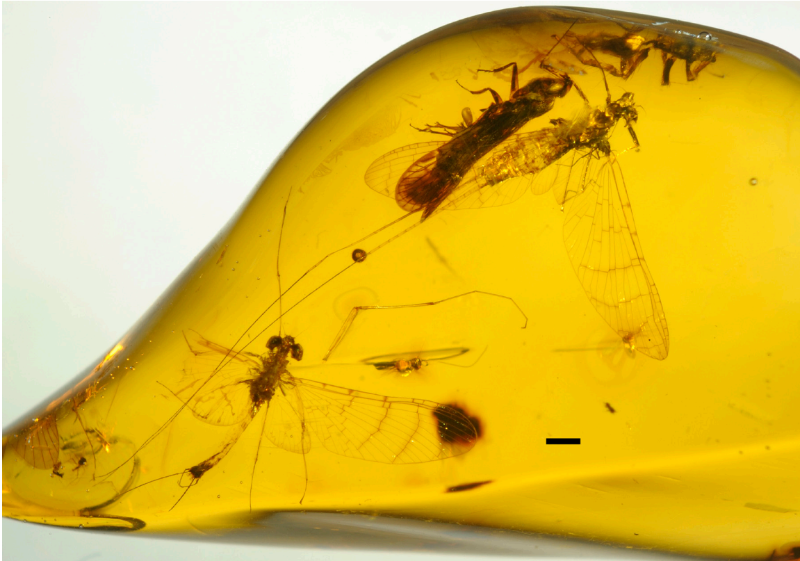
Figure 1. Overview of the Mexican amber piece NMS G.2008.34.3 showing inclusions- bottom left, male imago holotype of Maccaffertium annae sp. nov.; top right female imago paratype, partially overlain by a fulgoroid bug.